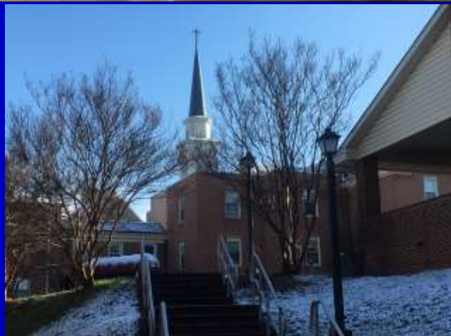
The Sanctuary Choir and Orchestra presented "Gloria" by Vivaldi on Palm Sunday. Humble Praise leads worship at 9:00am. Thrasher in the snow.

707 East Washington Avenue Vinton, VA 24179 (540) 344-4708 www.thrasherumc.org